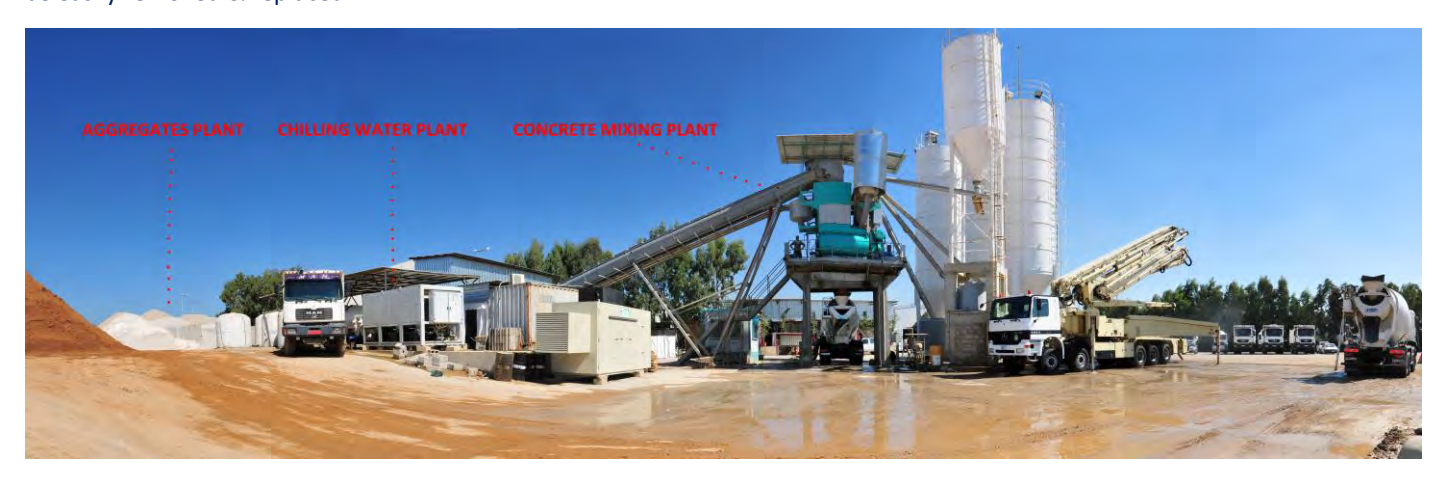
COOLER® Service Department is always available to serve our customer and ready to solve any problem. COOLER® Project Department is ready to study cases and to supply the most economic, yet feasible solutions.

ACCESS to all internal parts for cleaning or maintenance, needs loosening of a few screws only to remove any pane. All parts can be easily removed & replaced.